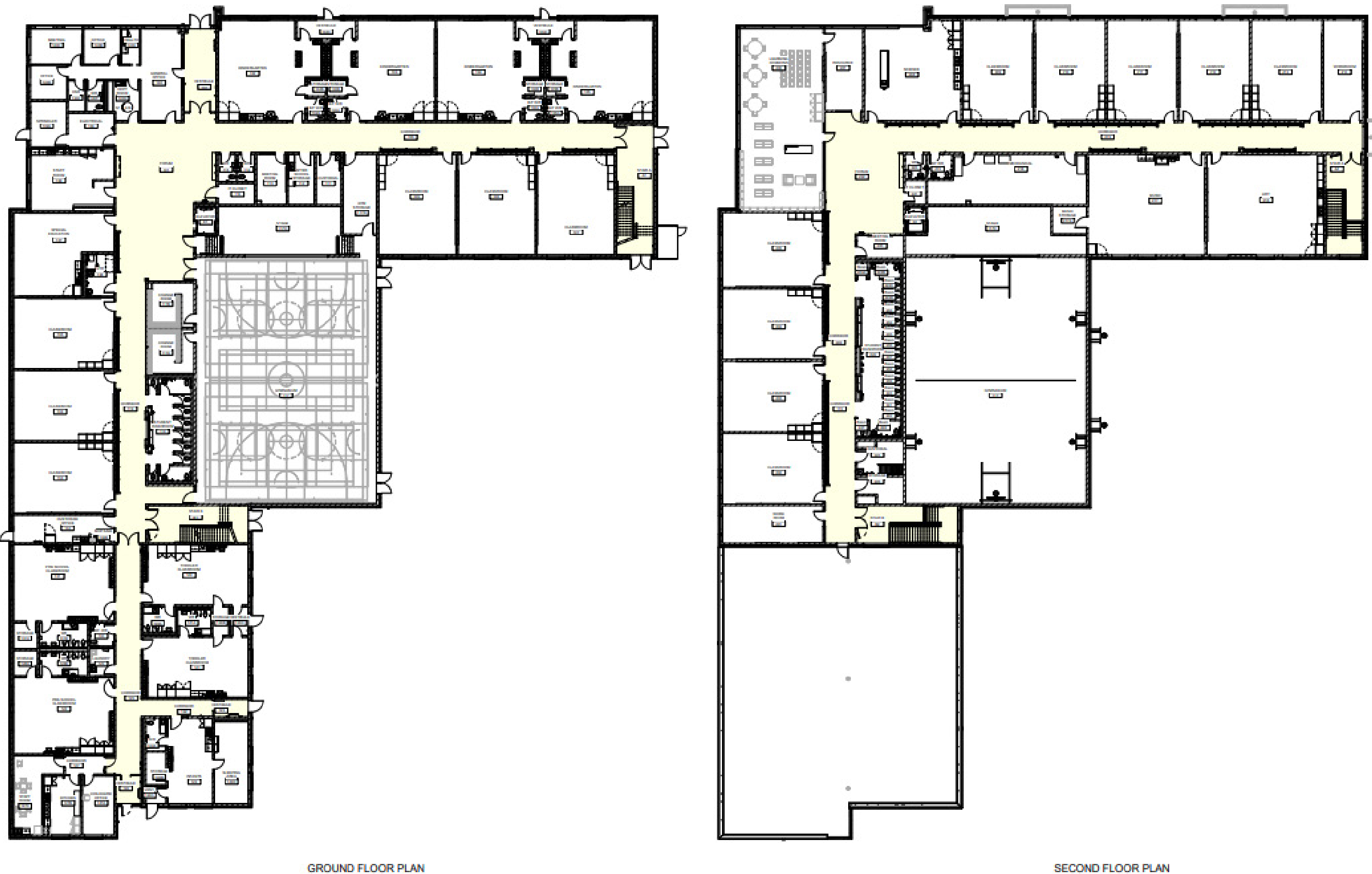
Waterdown Elementary School